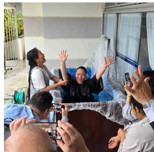
One of the two baptisms from this month. This Japanese lady had recently received the holy ghost while attending a small group.