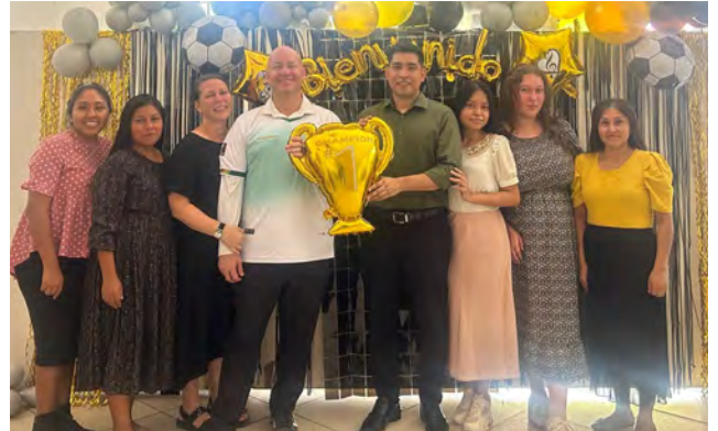
LPSC Music Team