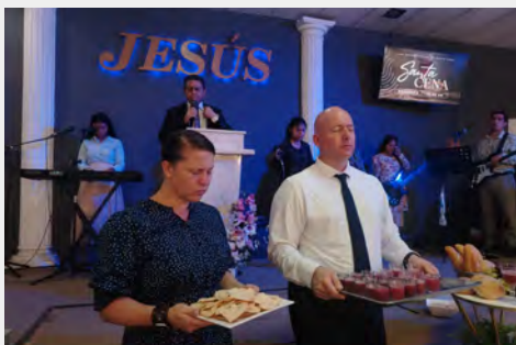
Serving Communion at LPSC