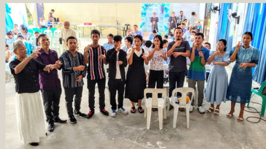
We were involved in two church anniversary services that needed help interpreting for the Deaf. At Mt. Zion, our home church, we had 31 Deaf in attendance, some traveling 2 hours for the service. Each Deaf family received a 5kg bag of rice for Christmas and clothing and toys that were donated by friends in America.