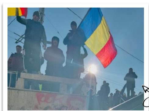
Protests at the block I live on

We had about fifty pairs of gloves with invites and a sweet treat attached to hand out to those in need. There are quite a few homeless people, especially downtown, so this was a wonderful way to reach out to our community.