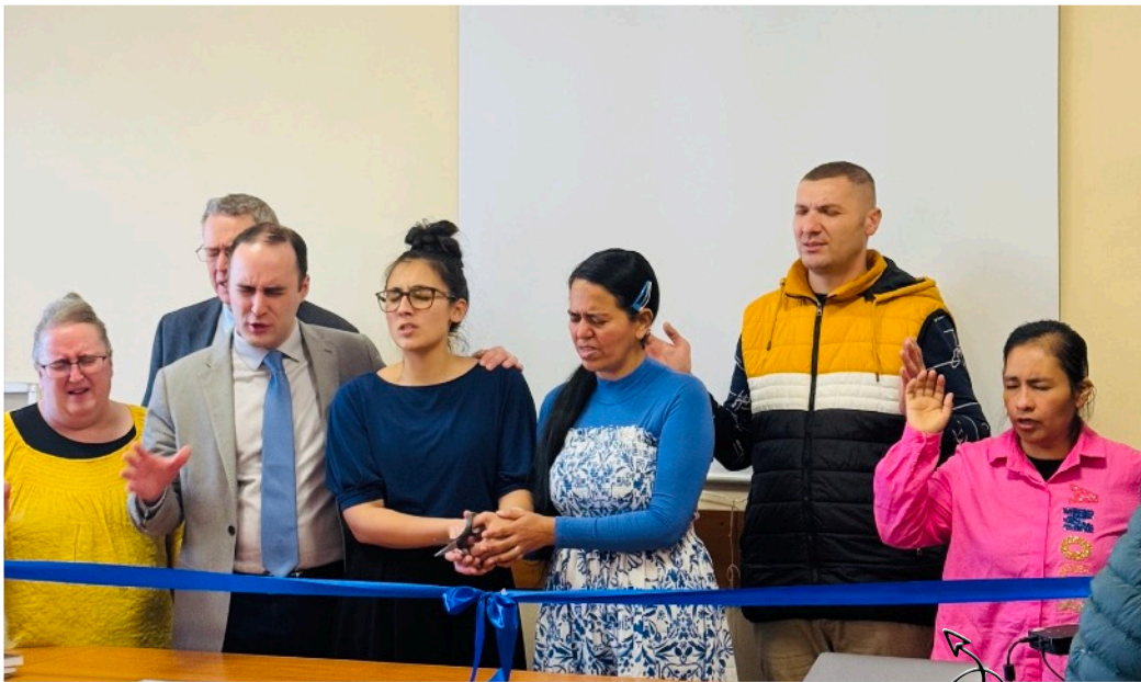
Braila installation service and ribbon cutting