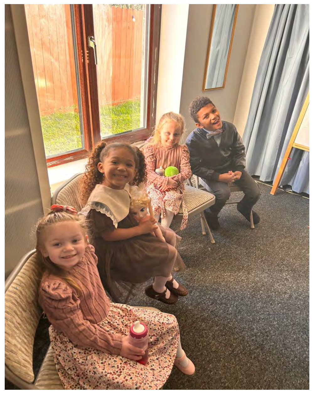
Sunday School! 🕅

This is three of four sisters who started coming to POG with their parents when they were very young. My father baptized them and their parents many years ago. The sisters got the Holy Ghost at POG when they were just wee girls. It had been quite a few years since I've seen them all. But we ran into them on the street in a shop we none of us go to. Just like God to bring us all together again!