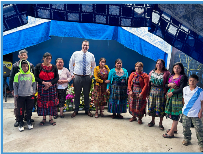
SAINTS OF THE CHURCH OF TAJUMULCO SAN MARCOS

In both Tajumulco and Malacatan we saw the presence of God fall in those services with several being renewed in the Holy Ghost.