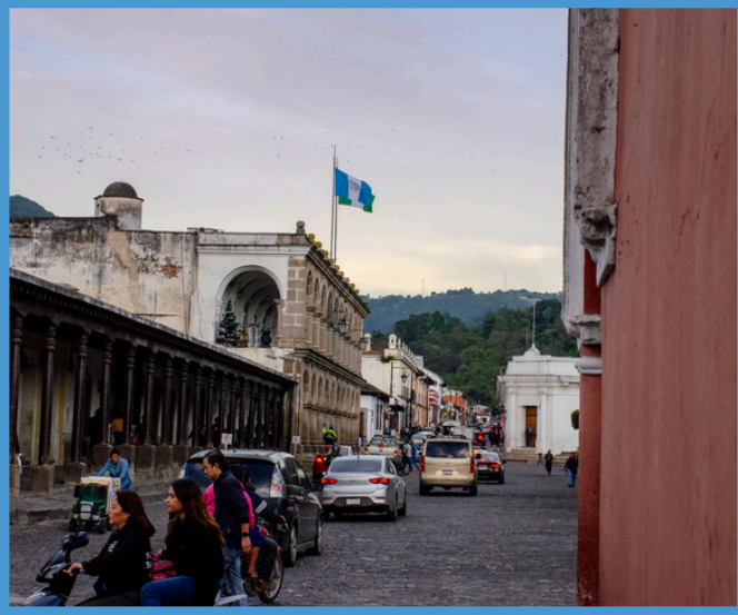
CENTRAL PARK MUNICIPAL BUILDING ANTIGUA, GUATEMALA.