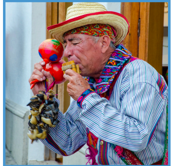
LOCAL ARTIST IN ANTIGUA, GUATEMALA.