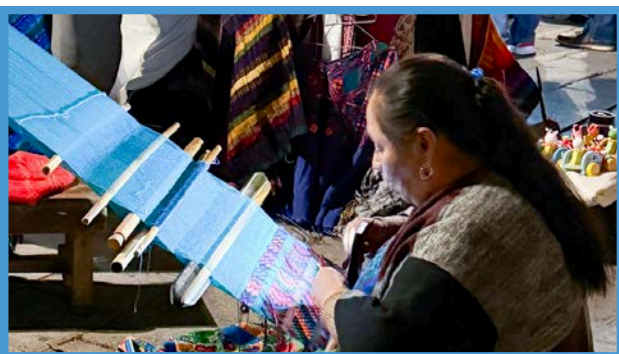
WOMAN HAND WEAVING FABRIC ON LOOM.

The buildings here are tight together, but don't let it deceive you. Inside are spacious courtyards full of people. If you are invited in, it is a treat because as a local said "behind every closed door is a grand surprise."