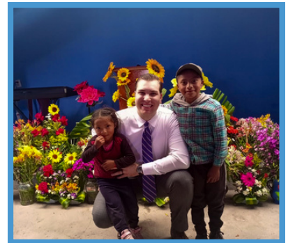
CHILDREN OF THE CHURCH OF TAJUMULCO SAN MARCOS