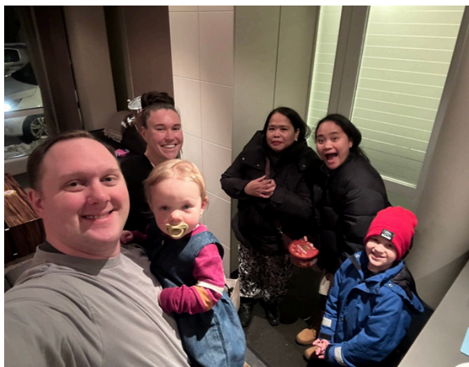
Photo below of our farewell gathering