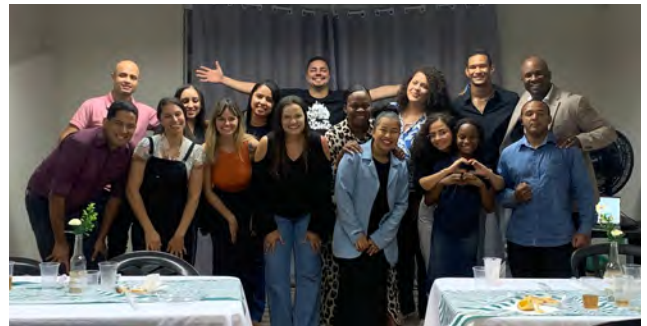
Photo of the class of people who attended the english program and attended the end of term party.