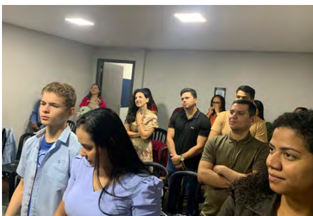
Picture of a church service with record attendance over 37 people present.