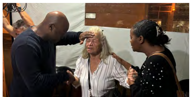
Praying with lady at new preaching point in North Brasilia.