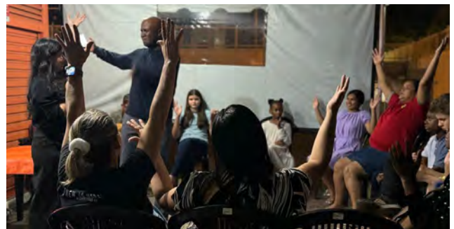
This photo is of a preaching point in North Brasilia.