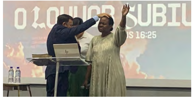
My wife being prayed over by the District Superintendent before preaching district music conference.