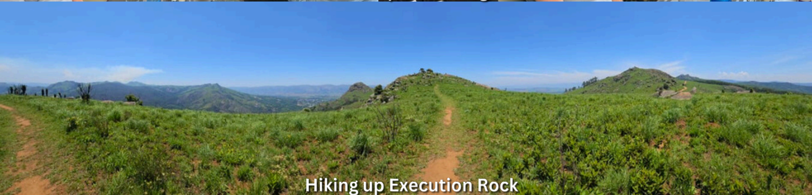
Hiking up Execution Rock