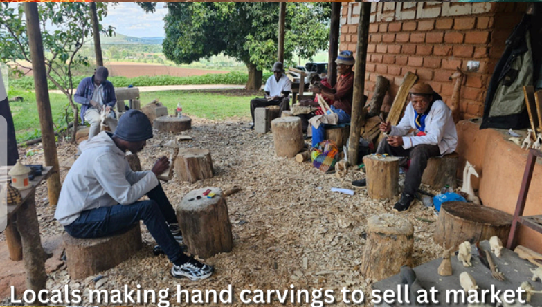
Locals making hand carvings to sell at market

The kids were so excited when the time came to start decorating for Christmas! It sure does feel strange to us to pose for a photo in front of a Christmas tree when it's over 100°F outside!