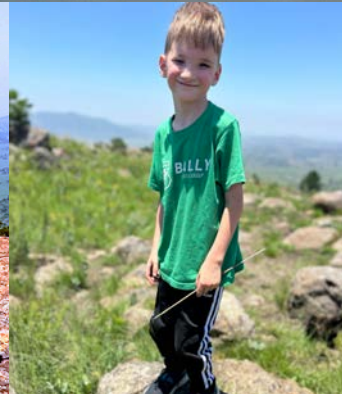
King of the mountain!