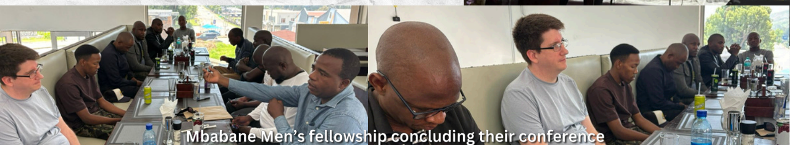
Mbabane Men's fellowship concluding their conference