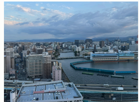
View of Fukuoka City from Port of Hakata.