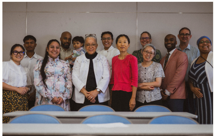
September 22nd - Our first church service with the Fukuoka Church.