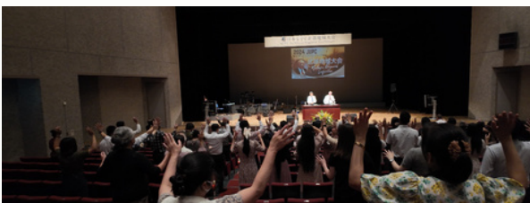
September 13-16, Northern Regional Conference in Tokyo. Five received the gift of the Holy Spirit!