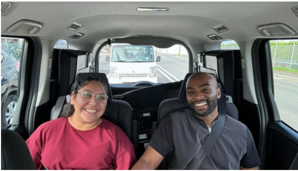
September 10th - Arrived in Japan. Nothing but smiles!

We are excited to share our first newsletter since arriving in Japan. God has faithfully provided, opened doors, and shown His goodness throughout our big move. We want to extend a heartfelt thank you to our PIMs, the Japan Missions Team, and our friends and family for your prayers and overwhelming support during this new and exciting season of our lives. We eagerly anticipate what the Lord has in store for this term!